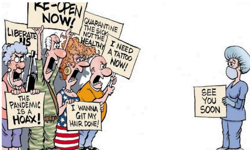
Fig.4: “This caricature from the USA fits the demo today.” (P18 post 38)

P8 counted herself and the twelve other people who had expressed similar opinions up to that point in time as belonging to a group that will be referred to here as the “affirmatives”. The multi-member group of affirmatives included the three spokespersons P1, P8 and P12 and other persons who later spoke up and either joined the group in terms