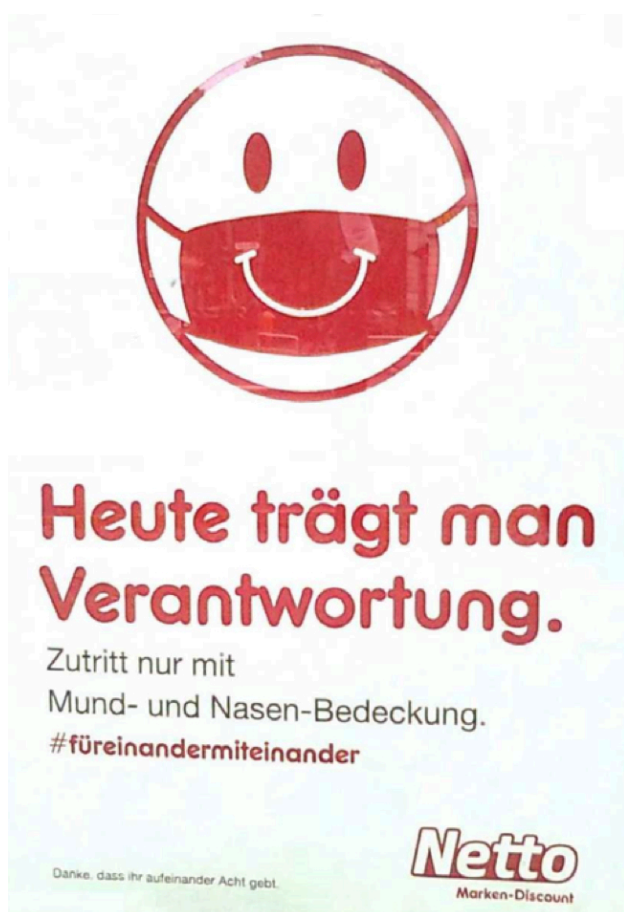
Fig. 1: Poster in windows of a major German discounter.

At the beginning of May 2020, the grocery chain NETTO, which belongs to the EDEKA group, put up posters in its Berlin stores (Fig.1), which aptly pictured this total enmity: Those who do not wear a face mask do not take responsibility and thereby disqualify themselves as a person